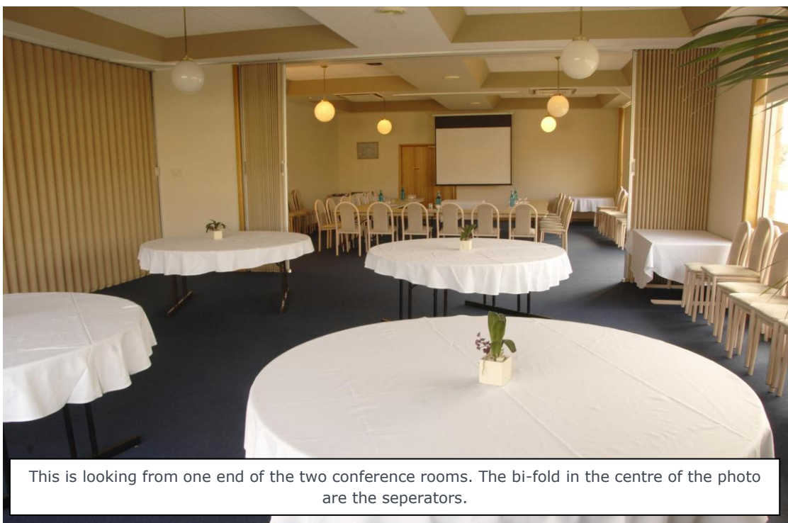
This is looking from one end of the two conference rooms. The bi-fold in the centre of the photo are the seperators.